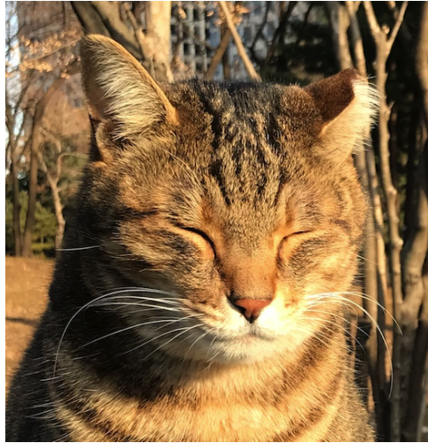
Figure 1: This cat picture is located at the 'figures' folder.

be close by. You can find out more about adding images to your documents in this help 133 article on including images on Overleaf . 134