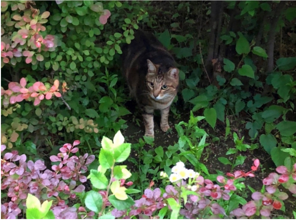
Figure B1: This cat picture is located at the 'figures' folder.

hac habitasse platea dictumst. Etiam condimentum facilis libero. Suspendisse in elit 384 quis nisl aliquam dapibus. Pellentesque auctor sapien. Sed egestas sapien nec lectus. 385 Pellentesque vel dui vel neque bibendum viverra. Aliquam porttitor nisl nec pede. Proin 386 mattis libero vel turpis. Donec rutrum mauris et libero. Proin euismod porta felis. Nam 387 lobortis, metus quis elementum commodo, nunc lectus elementum mauris, eget vulputate 388 ligula tellus eu neque. Vivamus eu dolor. 389