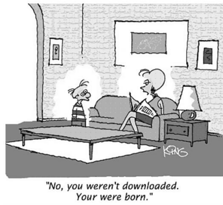
Figura 1. A typical figure