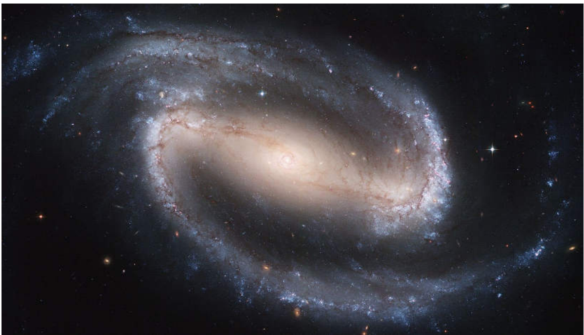
Figure 1: Sample Figure Caption.

It is common knowledge that the star closest to Earth is the Sun, and also that the Sun is yellow. It is this yellow sunlight which is interesting for some of its properties [3]. For instance, plants, algae, and cyanobacteria convert this light into energy via photosynthesis. In Figure 5 is a photo of a galaxy which contains many stars.[2]